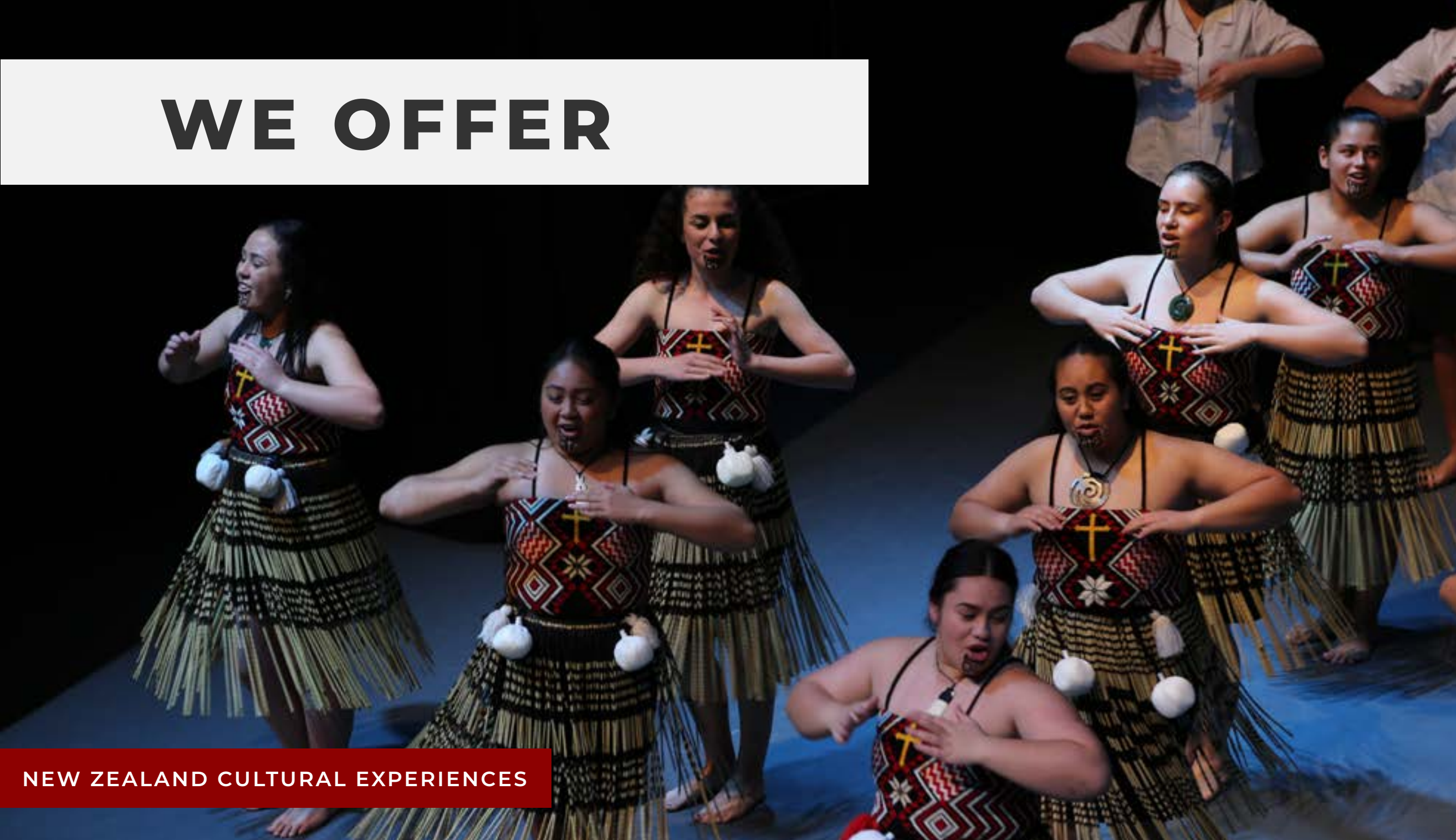
NEW ZEALAND CULTURAL EXPERIENCES