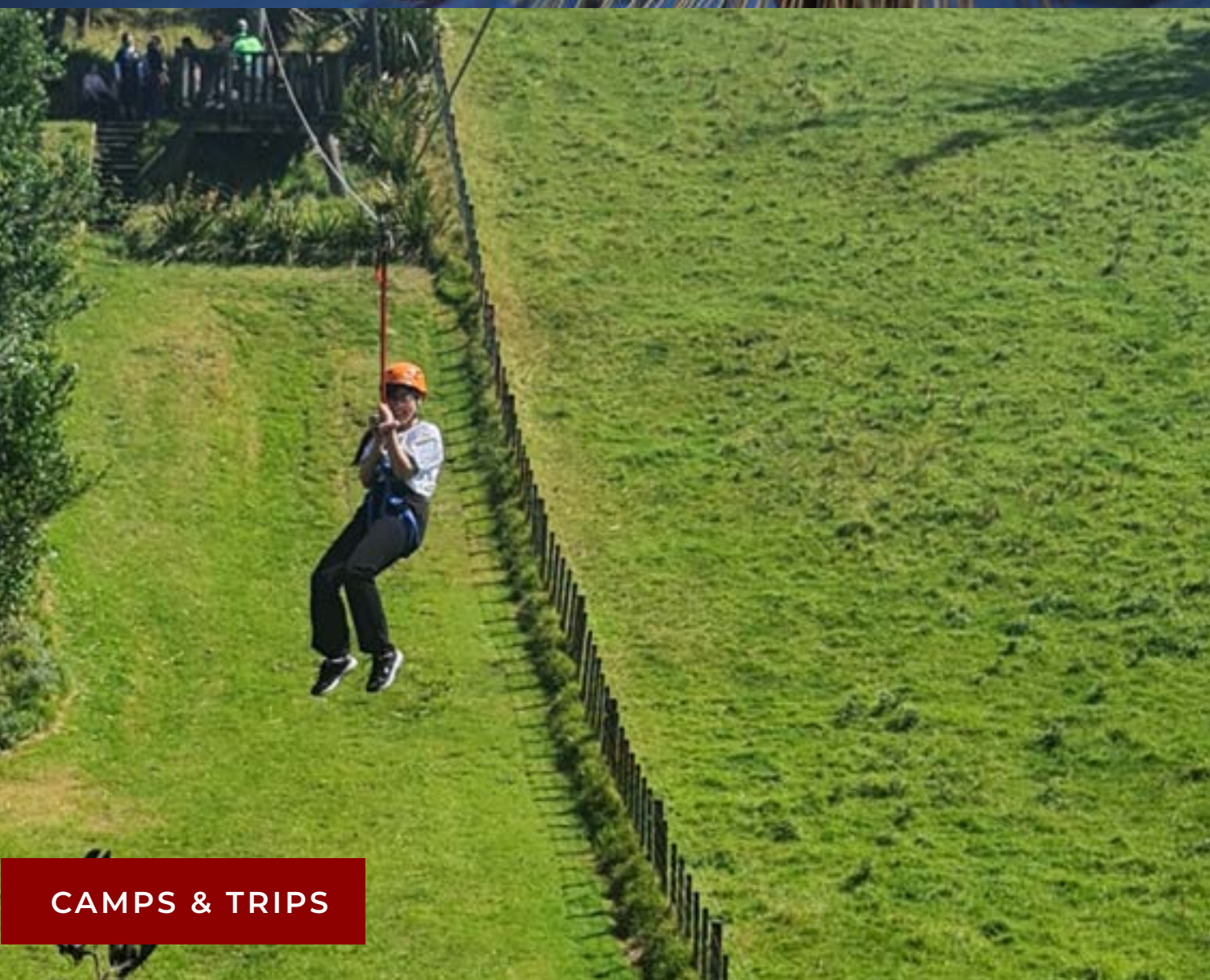
CAMPS & TRIPS